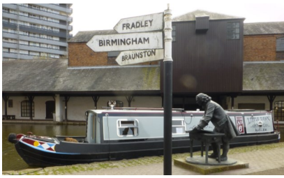
Little Dawn our 40ft syndicate boat.

“Due to her size, her running costs are cut by a third thus saving money all round”