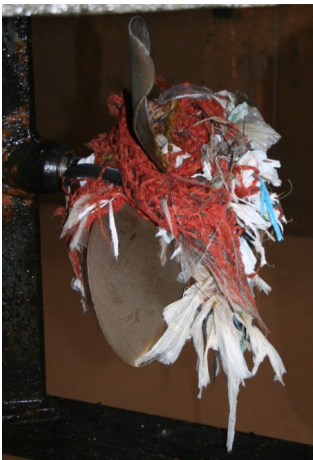
Prop which shows the damage that can be done as well as the debris which can collect on your prop if not checked regularly.

Over the last 12 months we seem to have had an increasing amount of damaged props on many of our syndicate boats. We urge you to check your prop regularly which involves putting your hand down the weed hatch and physically feeling the blades on your prop to check for damage. We are not teaching any of you who already do this to suck eggs however we just want to reiterate the importance of this as it can be a costly job, for example £1,200 to replace on Oakmere only