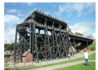
Anderton Boat Lift, just one of the things in the information guide for Anderton Marina.