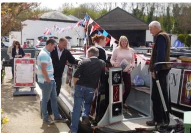
The buzzing Braunston Show, April 2014.