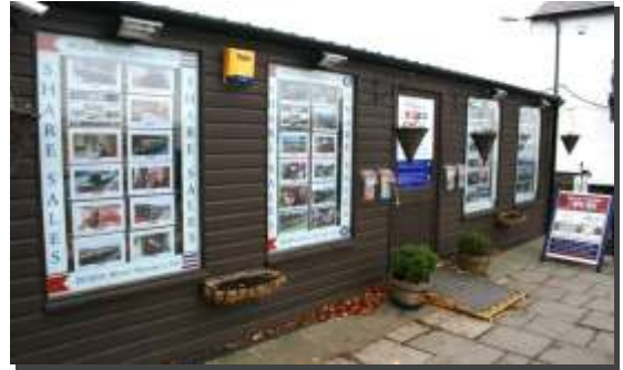
Here we are. Must remember to sweep up those leaves!

BCBM's now established office at the Nantwich Canal Centre allows the team to be at the hub of our expanding nationwide boat management and share sales activity. Recently installed is an ultra-fast broadband connection which means better service for any online enquiries. Importantly, it's where the managing, marketing and sales director works with other full-time staff on your behalf (in fairly comfortable chairs it has to be said). Most importantly, a call to our number never goes adrift. Despite this digital age, we're still passionate about old fashioned, one-to-one communications.