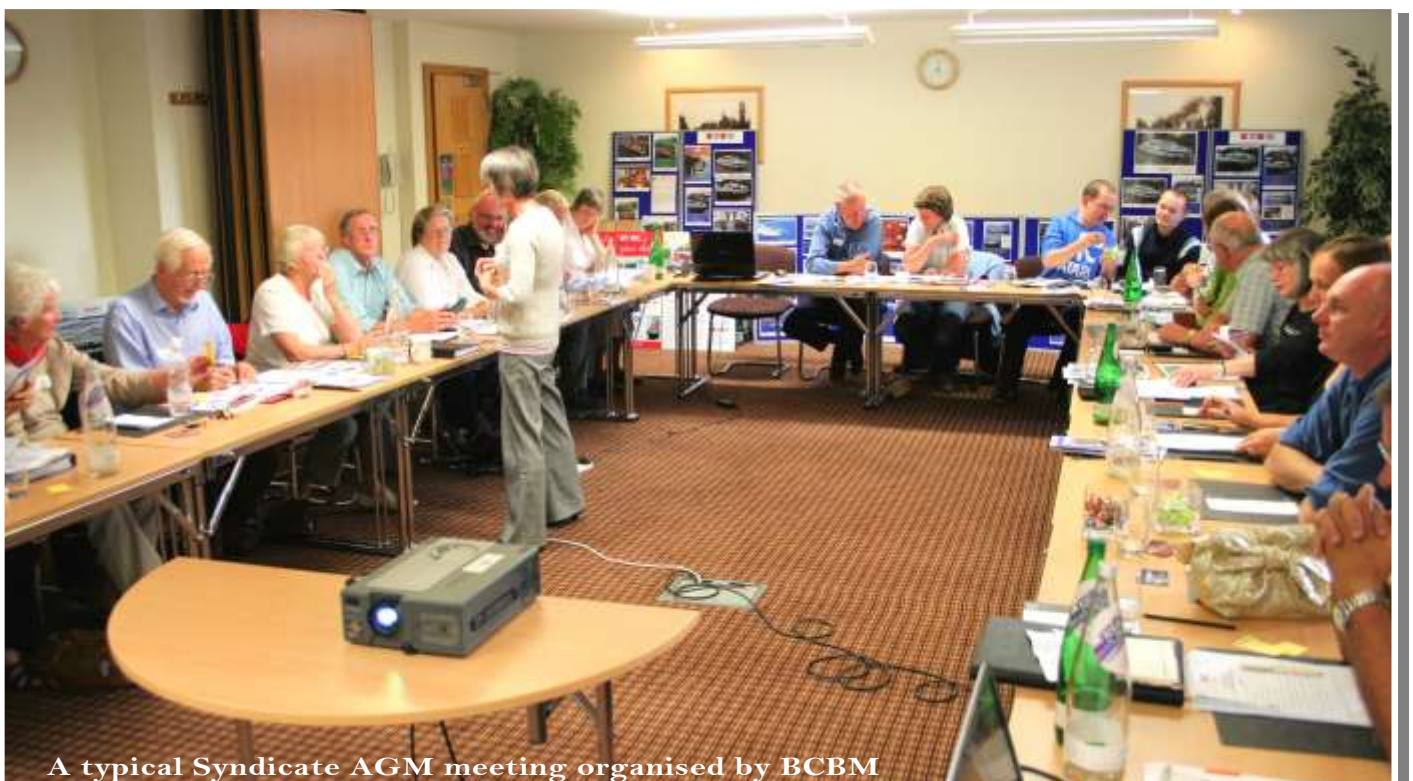
A typical Syndicate AGM meeting organised by BCBM

Protecting everyone's individual investment is what we're interested in. At your AGM, you and your fellow shareholders will decide whether to retain BCBM as your management company. Consequently, we know we must deliver on our promises. That means both looking after your boat and, in the event of you ever wishing to sell your share, trusting us to get you the best possible market price.