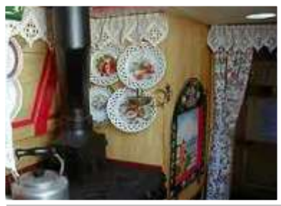
The perfect recreation of the cosy living quarters on most working boats like Raymond . The lace bordered plates and delicate curtains are typical examples of homely additions.

The “Rose & Castle” picture was an almost obligatory feature. However portrayed, it showed you accepted and respected the traditional working code of the canals, demonstrating consideration, courtesy and comradeship with all your fellow narrow-boaters.