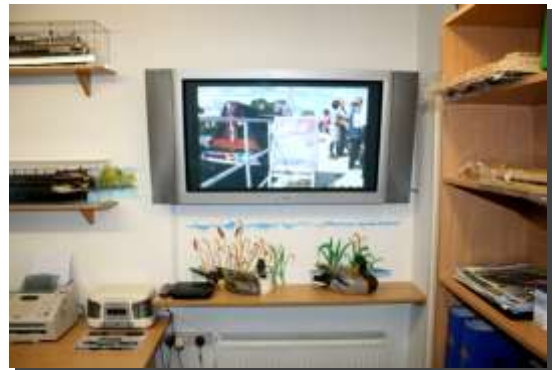
Welcome to our humble abode. The two ducks are known as Fred and Fredette. Make yourself comfortable. Insist on a cup of freshly brewed tea or coffee.