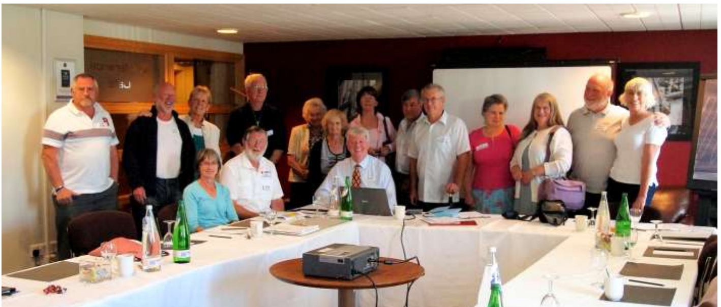
A "Soros" AGM, where once again a unanimous agreement was passed in favour of BCBM taking over boat management responsibilities