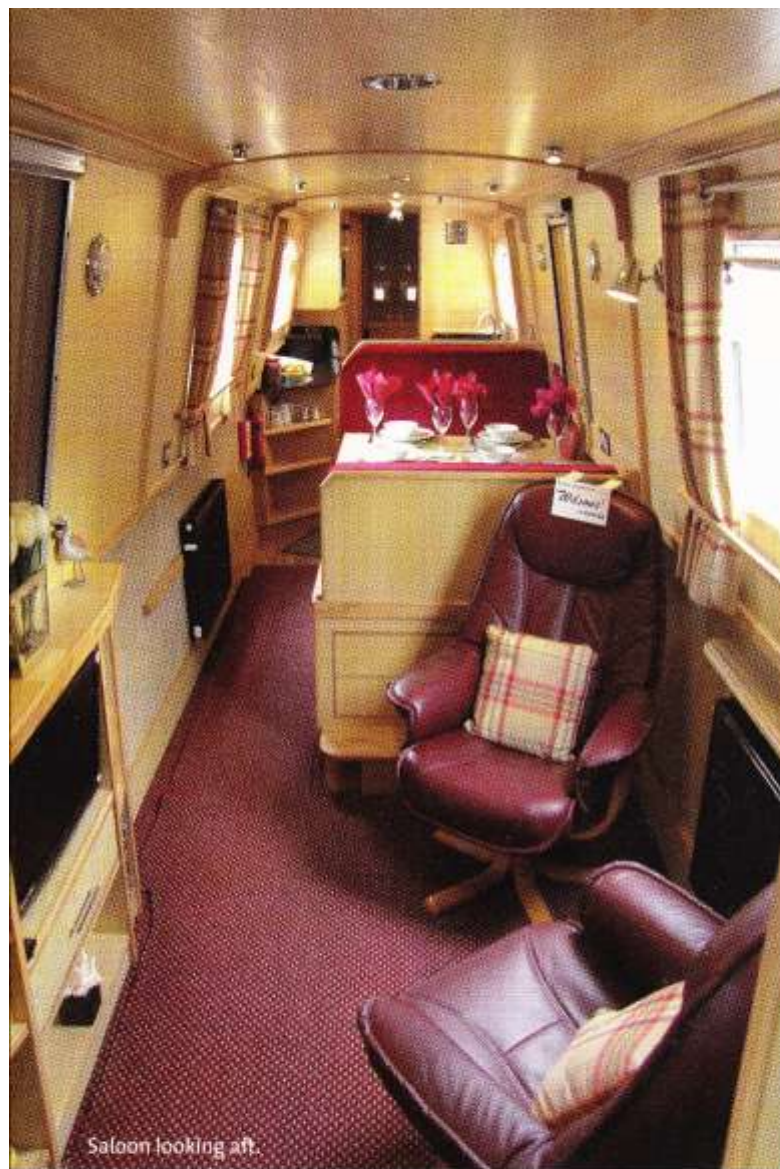
Saloon looking aft.