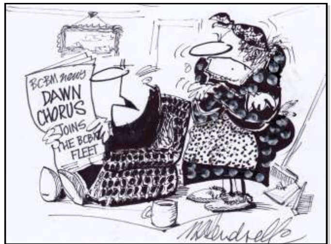
“Guess what dear...they've named a new narrowboat after you”