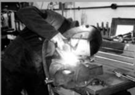
G H Fabrications

One of the enduring strengths of Broom and why they have maintained a leading position in the boat building industry for so long is the after sales service they provide. A major part of the business is providing extensive service and maintenance facilities for Broom built craft. Boats built over thirty years ago can frequently be seen being serviced and refurbished in the extensive maintenance shops.