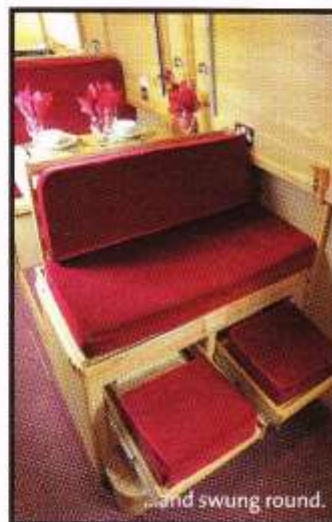
...and swung round.