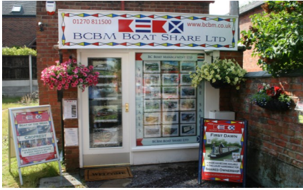
The BCBM office in Audlem